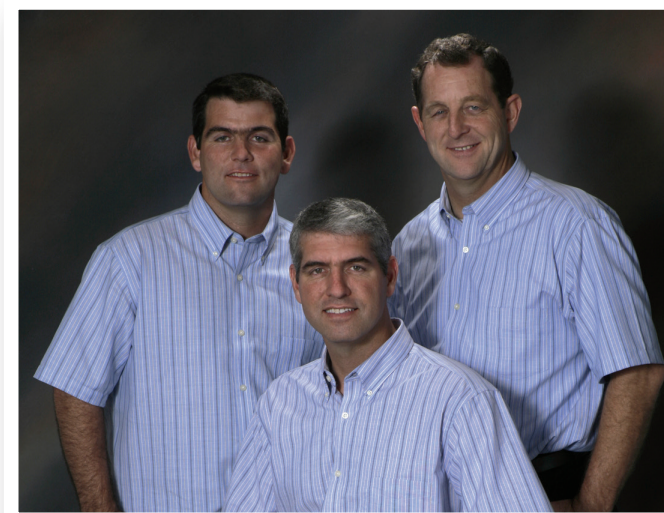
The Bear Brothers

UNIFORMED, PROFESSIONAL, TRAINED TECHNICIANS