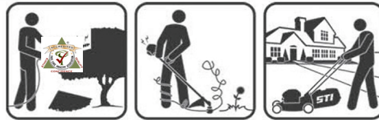
prune your bushes