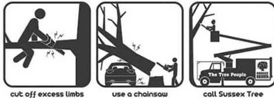
cut off excess limbs